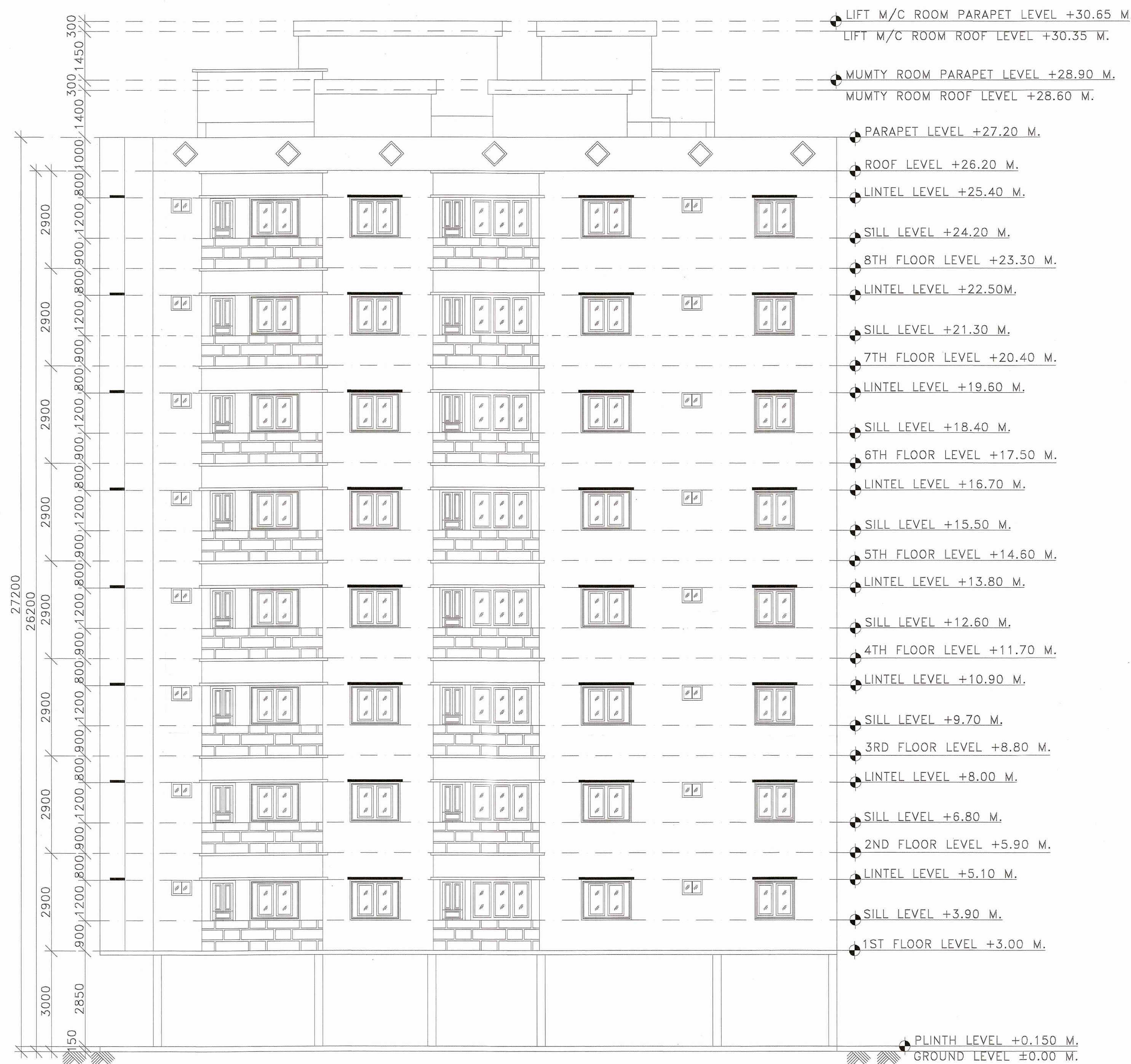
A FRONT SIDE ELEVATION SCALE: 1:100